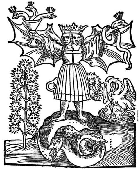
The Philosopher's Stone showing its Twin Nature